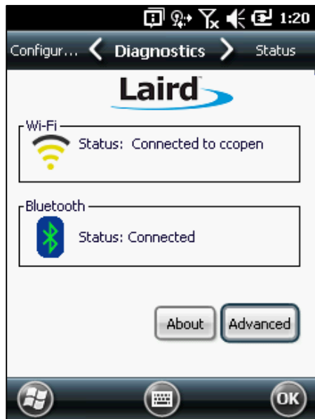
Figure 3: Diagnostics

The Diagnostics tab enables you to troubleshoot connection issues within LCM.