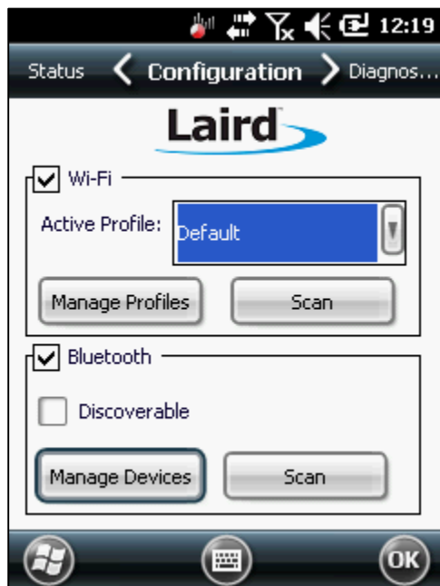
Figure 2: Configuration tab